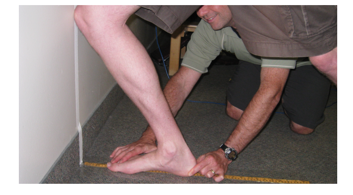
Figure 1 The Lunge Test