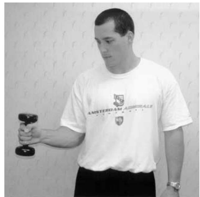
FIGURE 5. Standing external rotation at 0° abduction.

For the MVIC trials, the subject was instructed to “ramp up” to maximum effort. The investigator verbally encouraged the subject to reach and maintain maximum effort while EMG data were collected for 5 seconds. Once data collection was completed the subject was instructed to relax. EMG data during the first and last second of each MVIC trial was