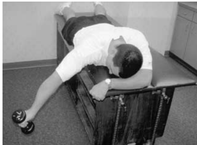
FIGURE 1. Prone horizontal abduction at 100° with full external rotation.

The inserted wires were then attached to the leads of the EMG system (Noraxon USA, Scottsdale, AZ). The subject was then passively moved through their available range of motion and instructed to actively move the shoulder joint in internal and external