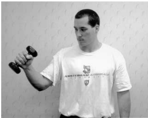
FIGURE 4. Standing external rotation in the scapular plane.

abducted to 90° with neutral rotation (palm down) with resistance applied just proximal to the elbow in an inferior direction. 21 The testing position for the posterior deltoid was with the arm abducted 90° with neutral rotation (palm down) with resistance applied just proximal to the elbow in the anterior direction. 21