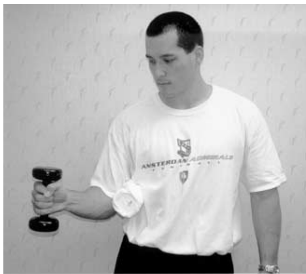
FIGURE 6. Standing external rotation at 0° abduction with a towel placed between elbow and body.