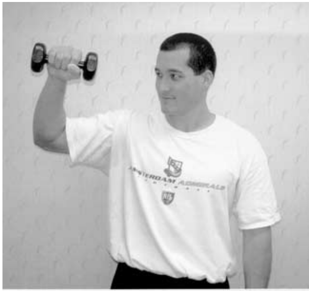
FIGURE 3. Standing external rotation at 90° abduction.